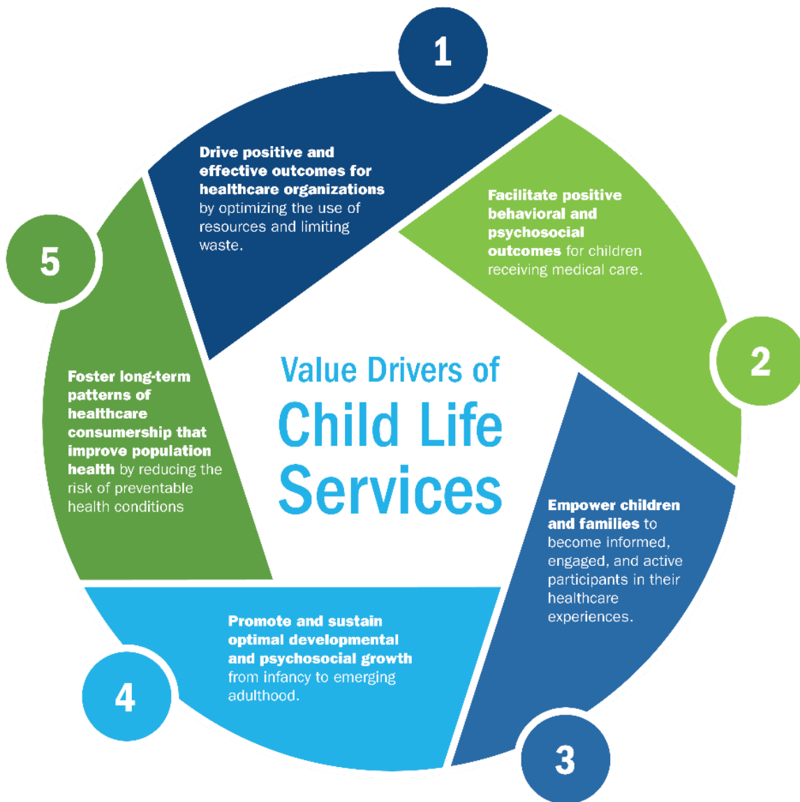
Figure 2. The Five Value Drivers of Child Life Services.