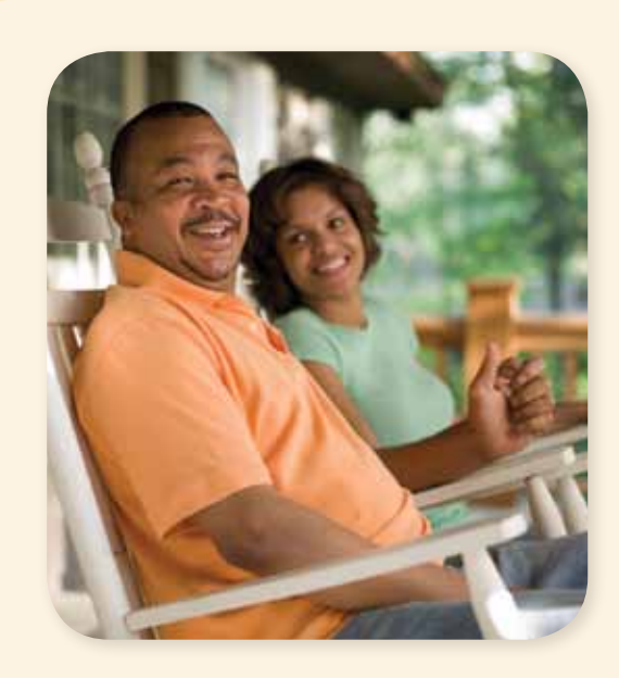
Serving patients from 173 countries

36% of Denver's babies are born at Denver Health