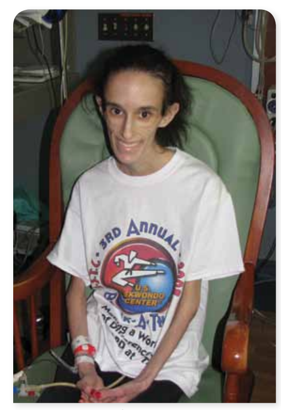
Patient during her ACUTE stay at Denver Health.