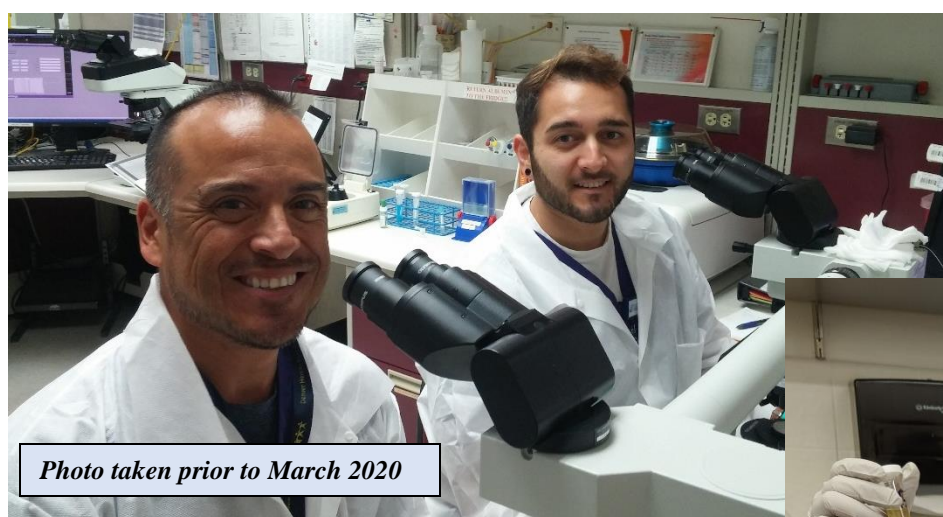
Photo taken prior to March 2020