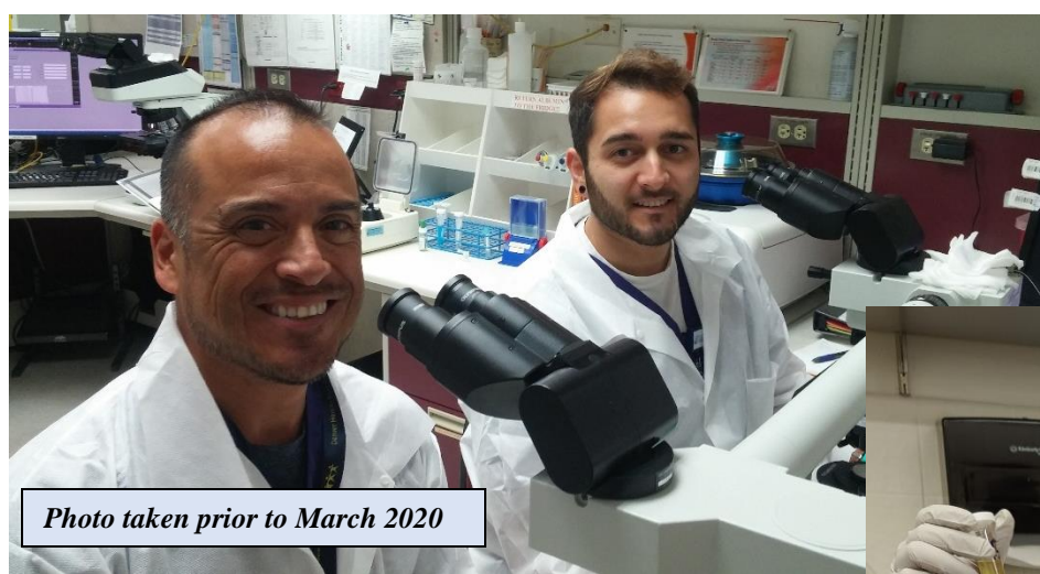
Photo taken prior to March 2020