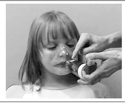
8. Take 6 slow, deep breaths. Make sure white flap goes up and down with each breath.